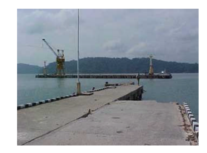
Figure 5. Collapse of the 80 m segment of approach in Great Nicobar Island jetty at Campbell Bay. This has adversely affected the relief work.