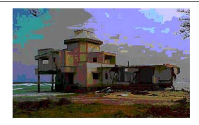
Figure 3. RC frame building (MES Inspection Bungalow) now stands in waters at the Military Residential Colony south of Malacca on the east coast of Car Nicobar Island. (Photo: C. V. R. Murty).

Electric power supply was severely affected: the 20 MW fossil-fuel based power plant at Bamboo Flat near Port Blair was flooded by tsunami waves causing extensive damage to electrical and mechanical equipment requiring several weeks for restoration. The 5.25 MW Kalpong hydroelectric power plant near Diglipur, North Andaman Islands, also suffered damage to its turbines which could be restored only partially in a week's time. The collapse