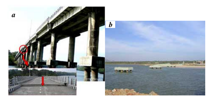
Figure 6. a , Three middle spans of Chengappa Bridge over Austen Strait connecting Middle Andaman and North Andaman Islands, 230 km north of Port Blair fell off from the bearing due to ground shaking. (Photo: Durgesh C. Rai). b , Complete loss of spans of the four-span RC bridge at Melmannakudi due to tsunami. (Photo: Alpa Sheth).

of the transmission tower at Middle Strait further restricted its power distribution to North Andaman Islands. Longitudinal cracks at the crest of its rockfill reservoir dam were also observed.