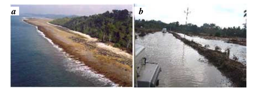
Figure 1. a, Up-throw of coral beds and rock strata due to uplift on the western coast of middle Andaman Island near Flat Island. b, Seawater flooded Andaman Trunk Road at Sipi Ghat area near Port Blair during high tide, suggesting subsidence of the landmass.

A number of jetties collapsed or were severely damaged in a number of islands