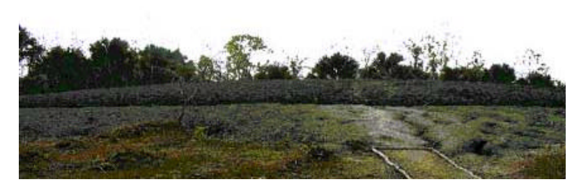
Figure 2. Eruption of a mud volcano near Jarawa Creek at Baratang Island in Middle Andaman, 105 km north of Port Blair.