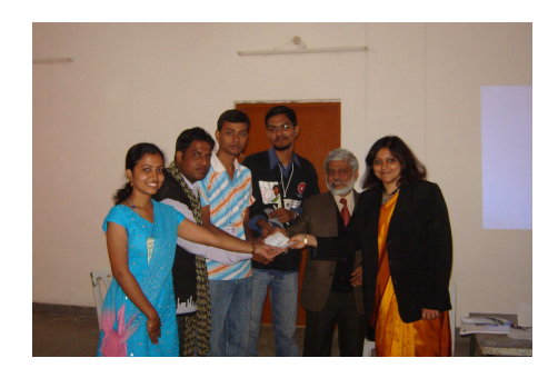
Winners of the NICEE Quiz at NASA, Bhopal, December, 2007